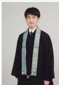
New Year's Greeting